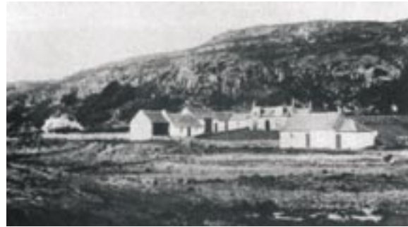
Little Cumbrae Farm and Farmhouse c.1900

of Robert the Bruce. The castle has striking similarities to those at Hunterston and Portencross and each played an important role for warning against invasion as part of a series of beacons down the Clyde coast. The first Royal Charter was signed in the castle in 1375 AD and Robert II may have spent much of his time on the island hunting deer and rabbits.