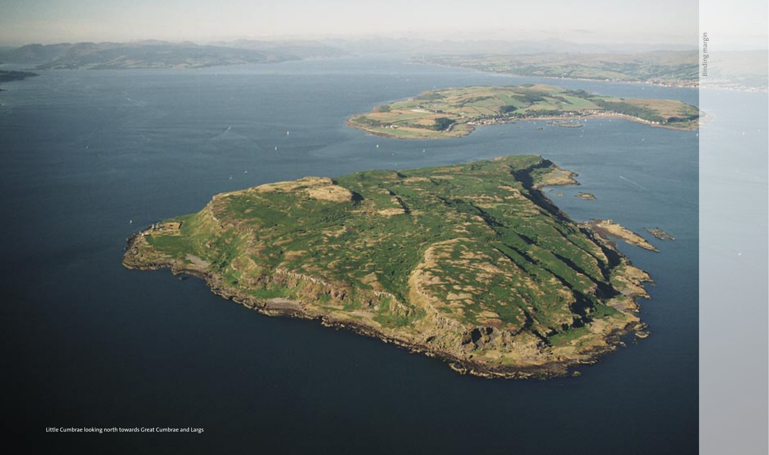
Little Cumbrae looking north towards Great Cumbrae and Largs