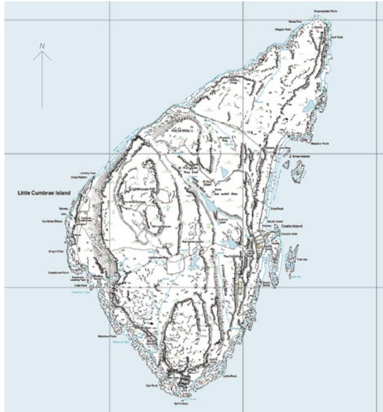
Not to scale. Licence number 100005384. This plan is for identification purposes only and does not form part of any contract.

A right of access exists in favour of Clyde Port Operations to service the property owned by them.