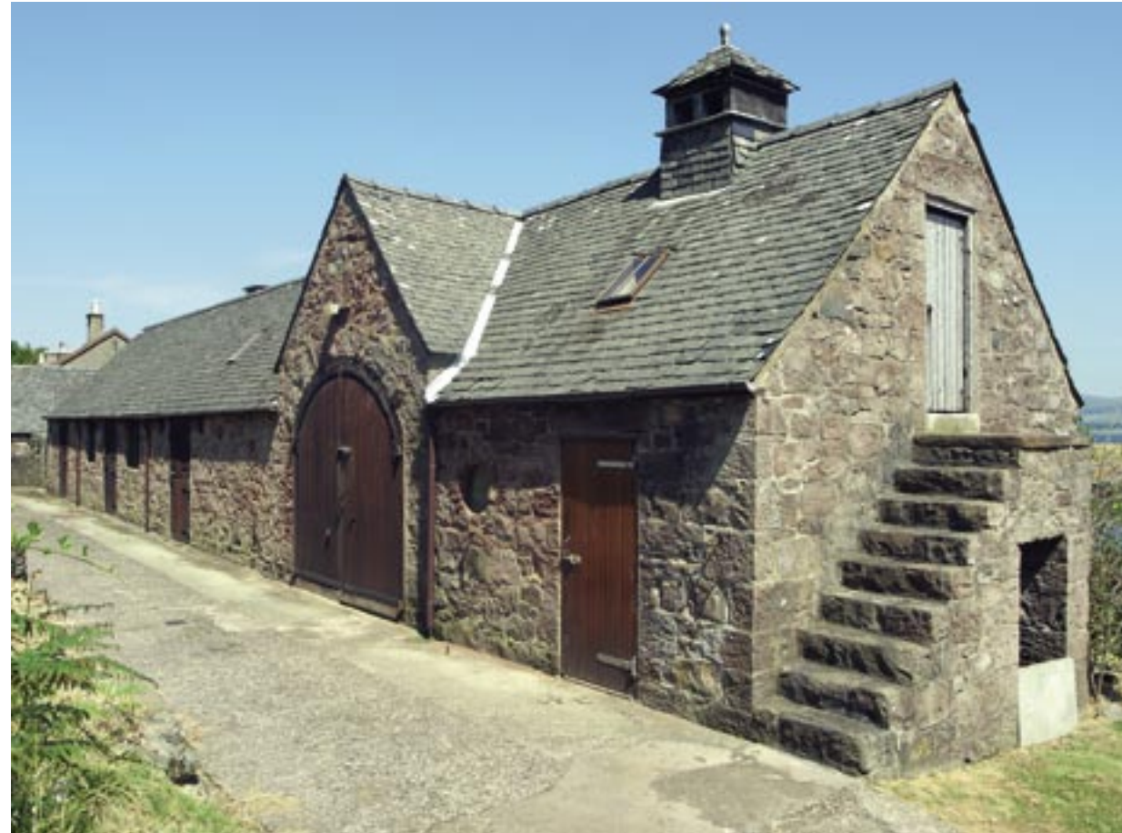
The Old Byre

Stone jetty providing small boat access at high and low tides.