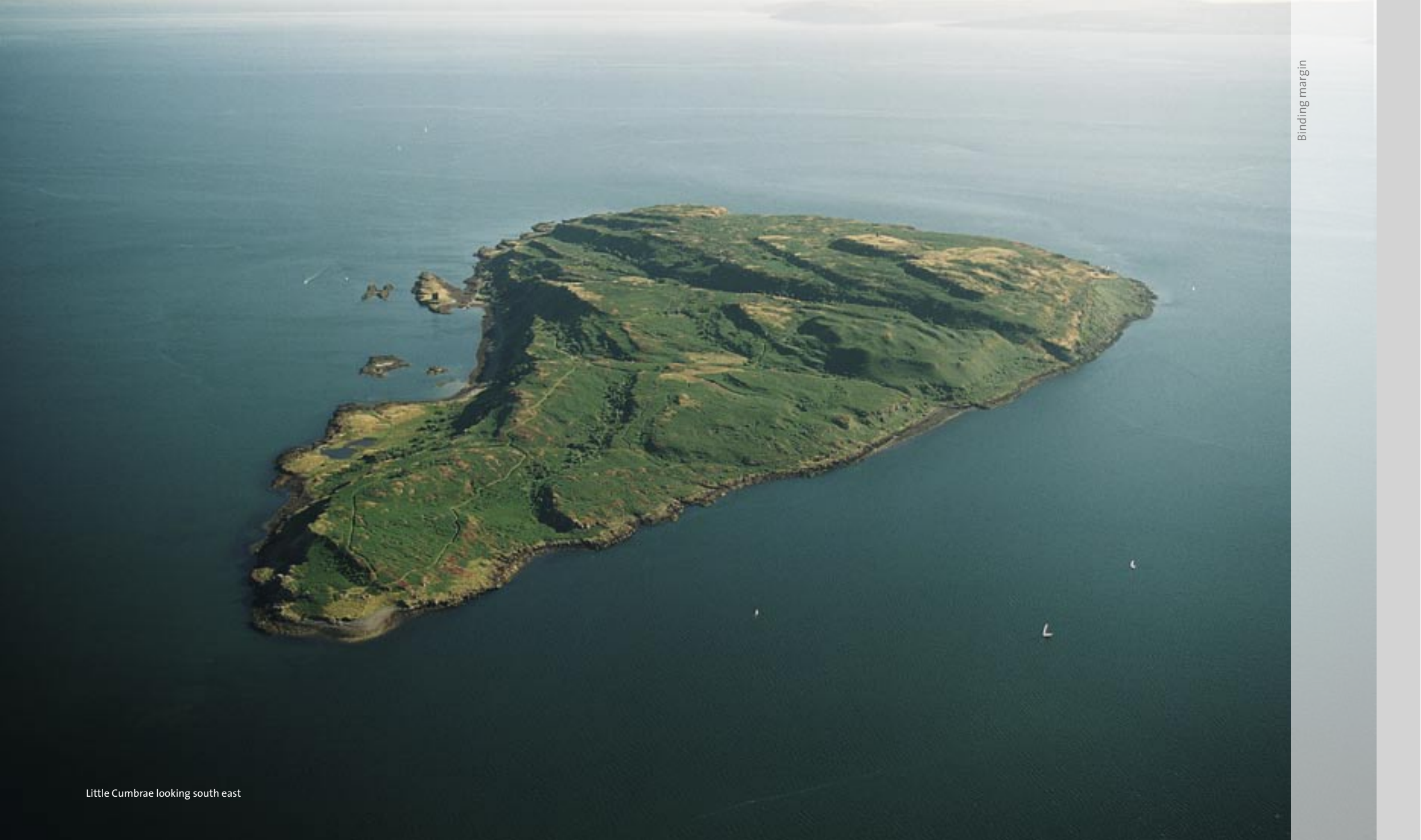
Little Cumbrae looking south east