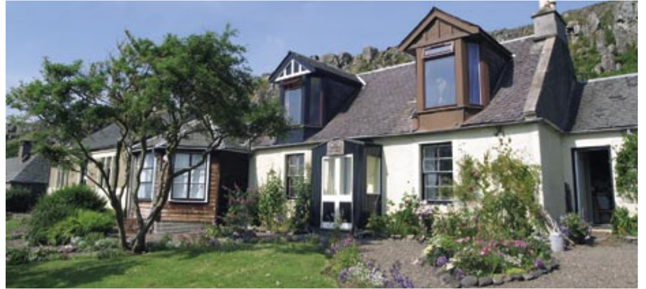
The Old Garden Cottage and Bothy