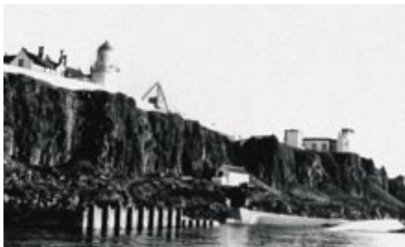
1865 Lighthouse Installation

In the 7th Century AD, a nun known as Saint Veya (previously based on Lindisfarne) established a religious cell on the island and there are still vestiges of the ancient ruined chapel of St Bey (alternatively called Santa Vey or Santa Wey). Monk's Cave (now known as King's Cave) was used for sheltering from storms and hostile invaders alike. The castle keep situated on Allimturraill (or Castle Island) is likely to have been built by Walter Stewart who was married to Marjorie, the only daughter