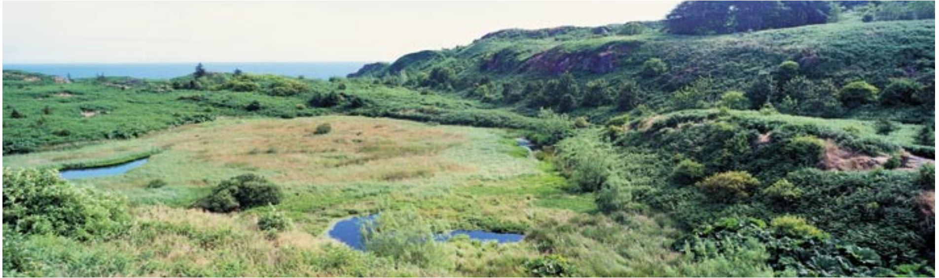
Site of proposed planning application for lodge development